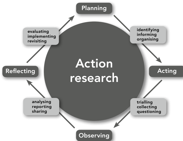
Figure 1: One ideal action research cycle

It might be represented diagrammatically as this: